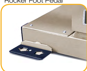
Mounted on both sides of the table base for easy height adjustment.

Cervical Thoracic Lumbar Pelvic Breakaway Thoracic release