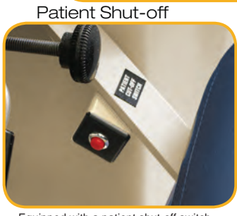
Equipped with a patient shut-off switch located near the left armrest