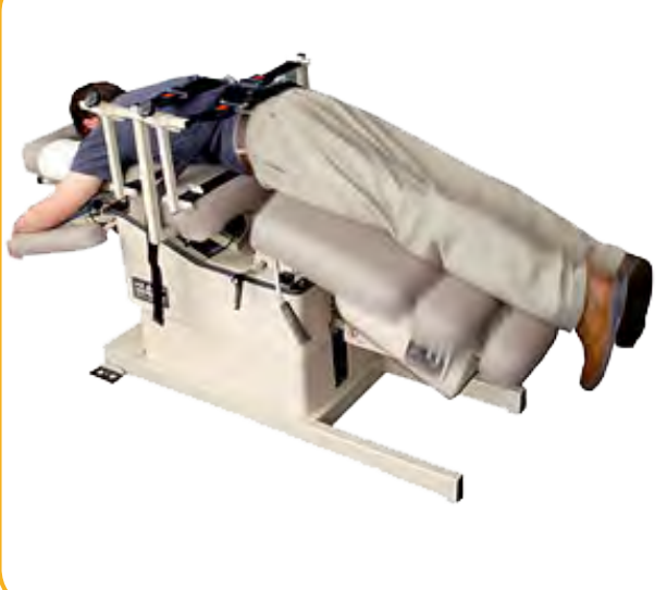
Hill AFT Scoliosis Treatment Package