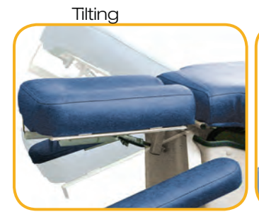
Hand lever releases the headpiece to lock at any angle from 30° positive to 30° negative.