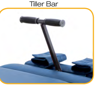
Inserts for using manual lateral movement or circumduction during a flexion treatment.